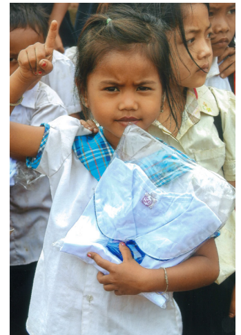
Students thankfully receiving their new uniforms and supplies on the first day back at school.